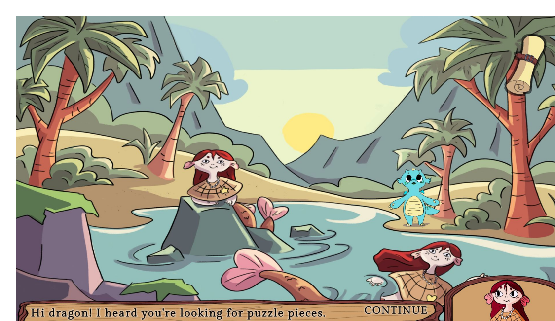
Uncover hidden treasure and find the mermaid's missing pets at the mermaid cove.

Download Dragon's Adventure at lavenderfog.itch.io/DragonsAdventure