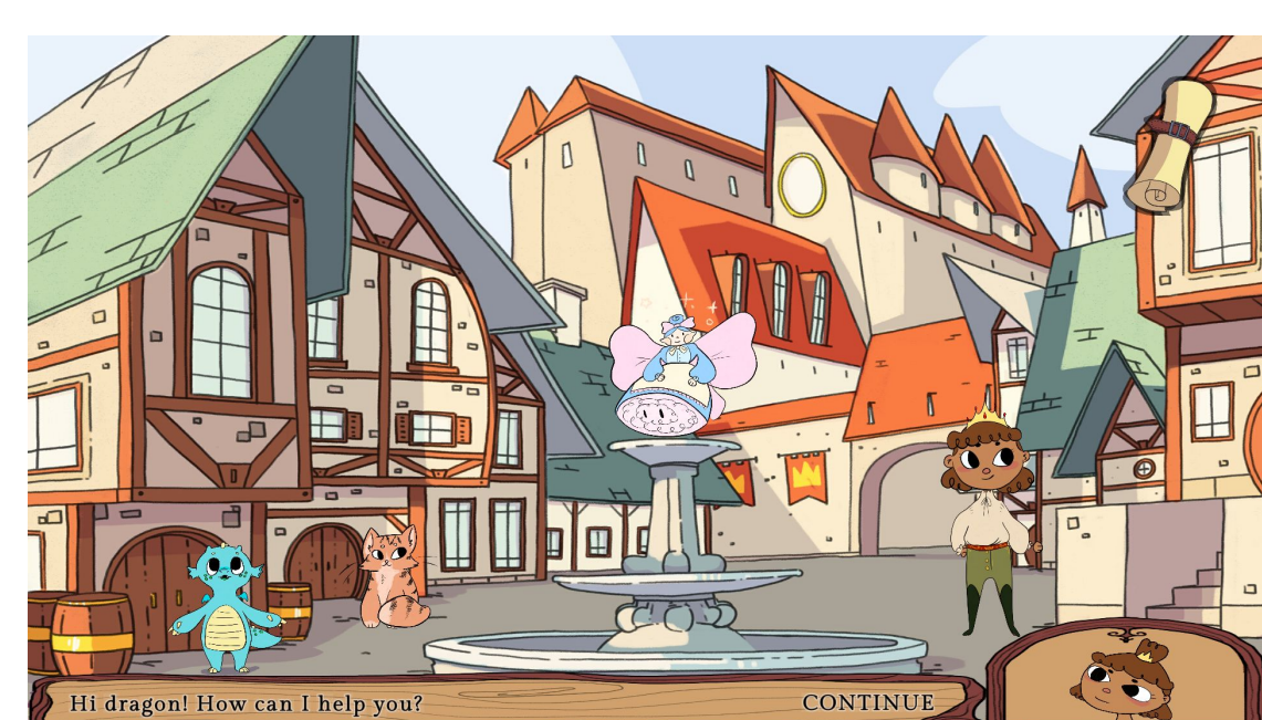
Help the princess select an outfit for the ball and beat the prince at rock-paper-scissors.