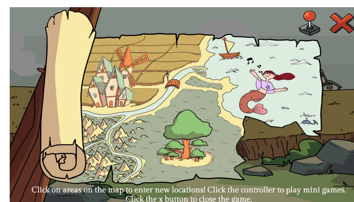
Visit the kingdom, a magical forest, the mermaid cove, or the arcade.