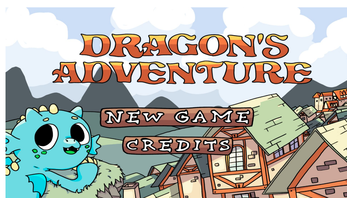
From the home screen, start a new game or view the credits.